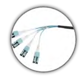
Optional Slim Trunks for 8, 12 & 24 Strand Count Cables