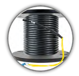
Indoor & Indoor/Outdoor Constructions