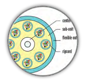
Made-to-Order Based on Your Requirements